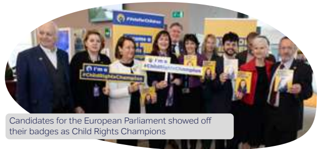
Candidates for the European Parliament showed off their badges as Child Rights Champions