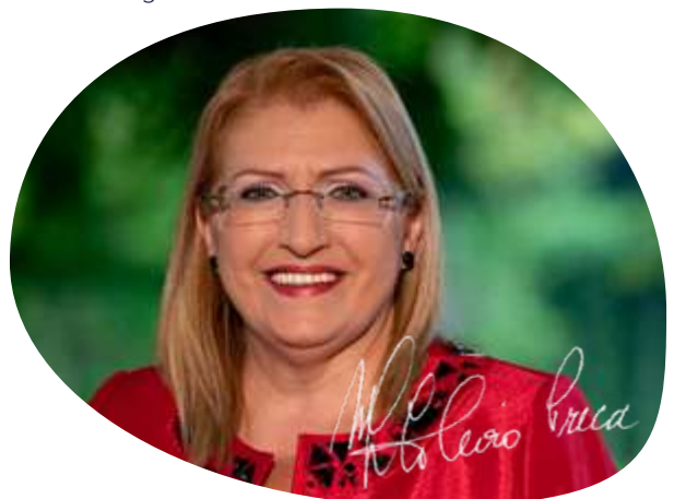
H.E. Marie-Louise Coleiro Preca President Emeritus of Malta President of Eurochild

The crisis will require Eurochild to redirect its efforts and adapt to new challenges. But our successes of last year – as documented in this Annual Report – provide a strong foundation on which to build. There has never been a more important time to defend children's rights.