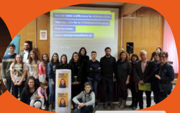
Group photo of Croatian children and candidates for the European Parliament elections