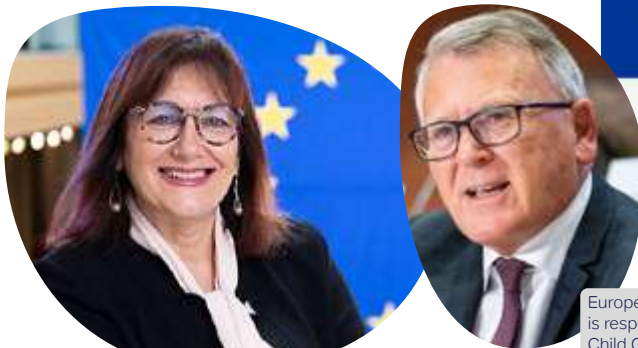
Vice-President of the European Commission Dubravka Šuica will prepare an EU strategy on the rights of the child

Commissioner for Children Sign the petition