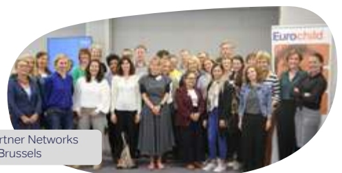
National Partner Networks meeting in Brussels

At the NPN meeting, Eurochild members in countries such as Bulgaria, Czechia, Hungary, Poland, Serbia and Slovakia shared their challenges of countering anti-child rights movements. For example, in Bulgaria disinformation campaigns have derailed adoption of important national policy reforms and undermined trust in civil society. The peer exchange offered through Eurochild is an important source of support and ideas on how to fight back. Eurochild also helps to draw attention to their concerns by connecting with European parliamentarians, co-signing letters to EU Commissioners and helping to attract media attention. The annual state of civil society report by CIVICUS, a global alliance of civil society organisations and activists dedicated to strengthening citizen action and civil society throughout the world, featured an interview with Eurochild and Child Rights Connect on these anti-child rights movements.