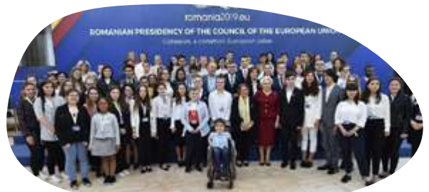
Children from across Europe joined the first Children’s Summit in Bucharest, Romania in May 2019

member shared the results of the Europe Kids Want survey, conducted by Eurochild and UNICEF over the span of a year to gather views of children. According to the Europe Kids Want survey, launched by the European Parliament and supported by Eurochild and UNICEF, only 8% of children respondents feel that adults listen to their opinions when making decisions in their community.