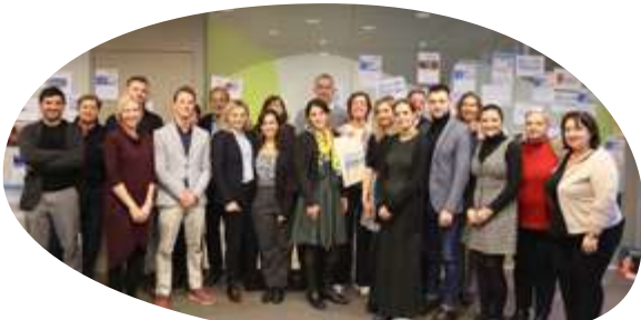
Final meeting of the campaign's international partners and national coordinators before the closing event

According to the external evaluation of the campaign, national coordinators expressed pride in their newfound ability to connect with EU officials and use EU tools to support their advocacy. The factsheets featuring key information from each campaign country played an invaluable role in supporting EU country desk officers in their dialogue with governments. Through its innovative advocacy of bringing national expertise to bear on European recommendations, the Opening Doors campaign has left an indelible mark on the EU's role as a champion of deinstitutionalisation.