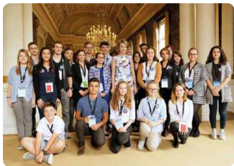
The Children and Young People Advisory Group meeting Her Majesty the Queen of Belgium

The Eurochild conference Children's Rights Matter: Why Europe needs to invest in children , gathered children and adults, policy makers, child rights experts, politicians, academics and others to answer the question why Europe needs to invest in children.