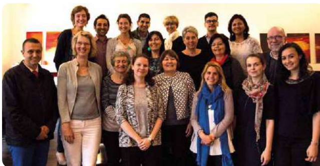
Outgoing and incoming members of the Management Board met with the Secretariat in June 2016