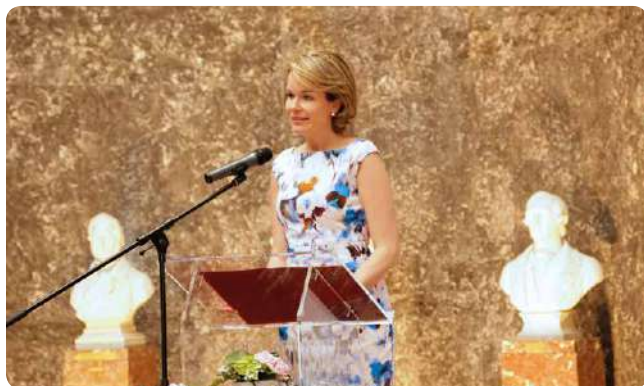
Her Majesty The Queen of Belgium opening the Eurochild Conference

In her address Her Majesty Queen Mathilde of the Belgians, Patron of the Conference gave powerful messages both to policy makers and to children and young people in the audience: