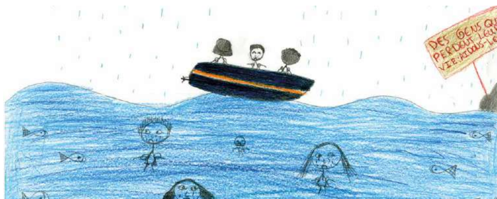
One of the many Sketch My Rights drawings depicting migrants and refugees. Drawing by Electra Sarantinou, 11 years

Read our joint statement: Children cannot wait: 7 priority actions to protect all refugee and migrant children