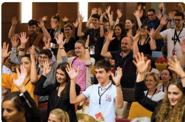
Warming up exercise at the Eurochild Conference 2016