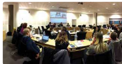
The National Partners Networks met in Strasbourg on 16 December

The second NPN meeting was jointly organised with ChildPact and supported by the Council of Europe in Strasbourg, France. NPNs familiarised themselves with Council of Europe's policy instruments and brainstormed on how to make better use of them. The NPNs also shared experiences of leveraging EU, Council of Europe and UN instruments and learned from each other about strengthening their impact.