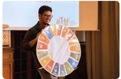
The Sustainable Development Goals explained on stage at the CATS Conference 2016

Eurochild continued its engagement in global discussions with civil society actors working to end child poverty through the Global Coalition. We participated in the Research Scoping meeting co-hosted by the Impact Initiative and the Global Coalition to End Child Poverty to identify research gaps in the broad area of child poverty, setting the tone for the Research Conference planned by the coalition for 2017.