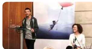
Young people report back at Council of Europe Conference at the launch of the strategy on the rights of the child

Eurochild helped 10 children participate in the high-level conference to launch the Council of Europe's Strategy on the Rights of the Child (2016-2021) in Sofia in April. With the support