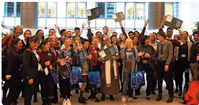
Group photo from the With Children For Children event at the European Parliament