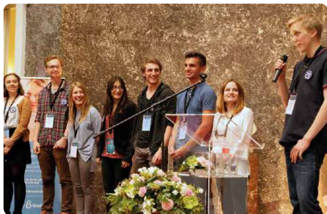
The Young Reporters Team on stage