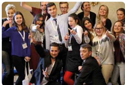
Younger participants at the CATS Conference 2016